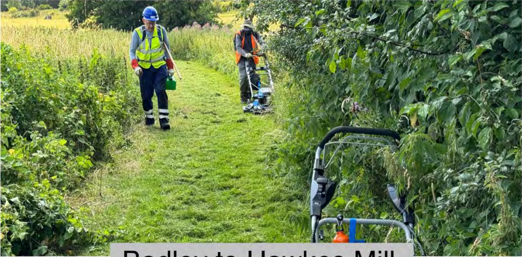
Badley to Hawkes Mill July 2024