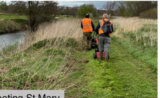
Badley to Creeting St Mary