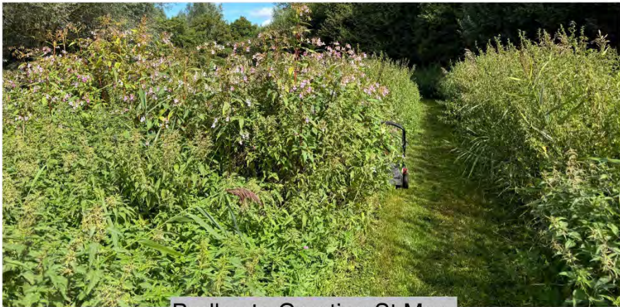
Badley to Creting St Mary August 2024