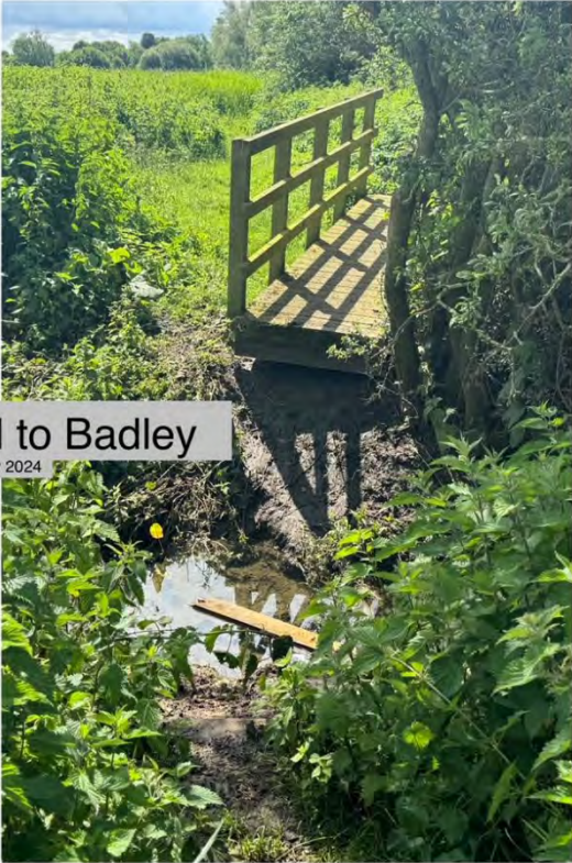
Hawkes Mill to Badley