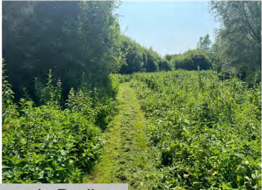
Hawkes Mill towards Badley June 2024